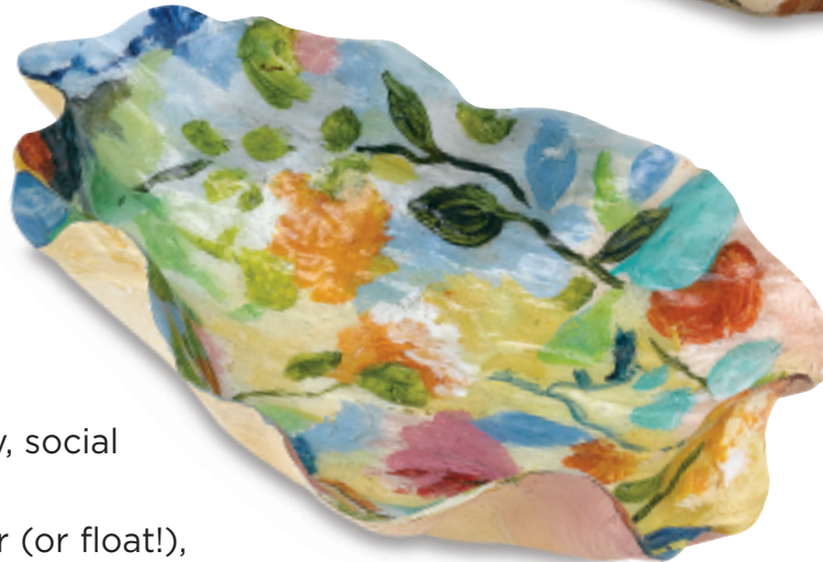
Left: Gel-ly Bowl formed and painted with Golden Fluid Acrylic Colors