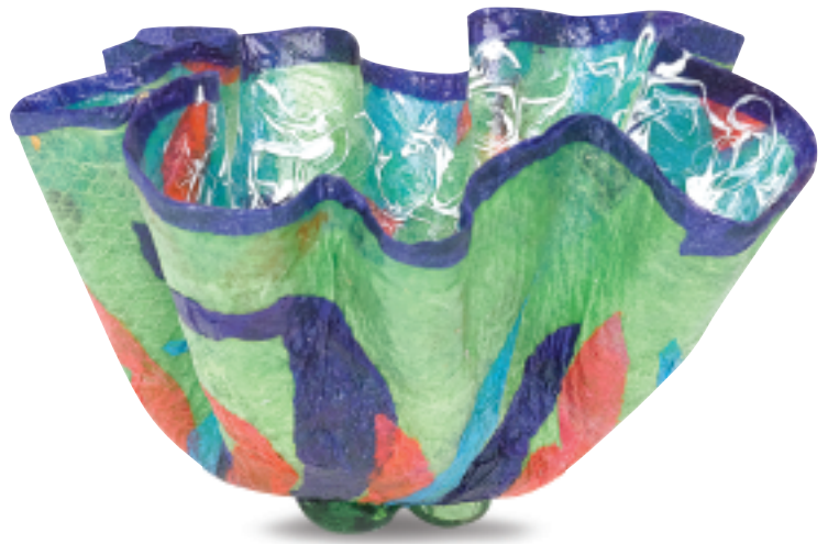
Gel-ly Bowl formed with Blick Tissue Paper collage, Golden Fluid Acrylic paint and glass globes for feet